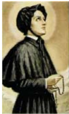
St. Elizabeth Seton