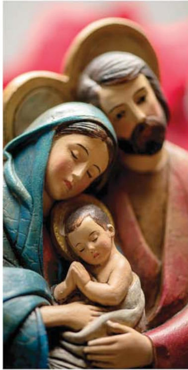
Mary, Joseph and the baby Jesus are depicted in a wooden creche at Sacred Heart Cathedral in Rochester, N.Y., in this Nov. 24 photo.

If God draws us to himself with love, and not through guilt or compulsion, how important it is that we, too, should witness to our faith in the same manner. How important this is in building up a culture of life! As many of us approach the New Year with resolutions, this seems an appropriate time to consider our pro-life witness in the light of charity.